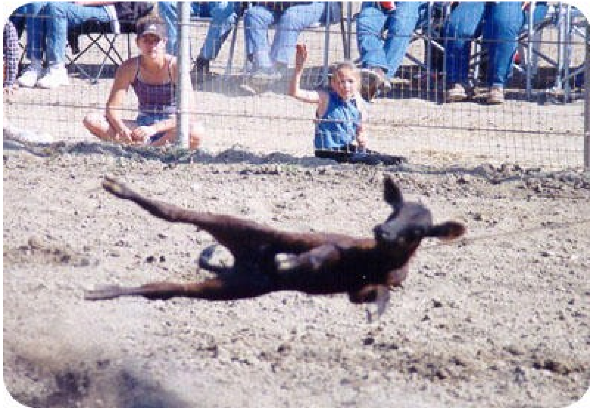
A calf being 'clotheslined'

In rope and tying, a calf is let out of a chute and chased by a rider with a rope attached to