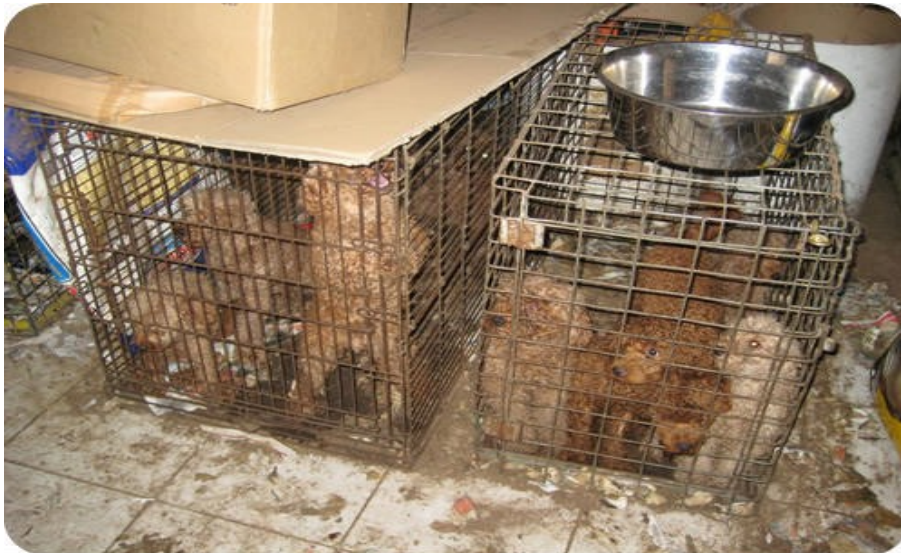
Puppies crammed in cages at a backyard puppy mill in Queensland