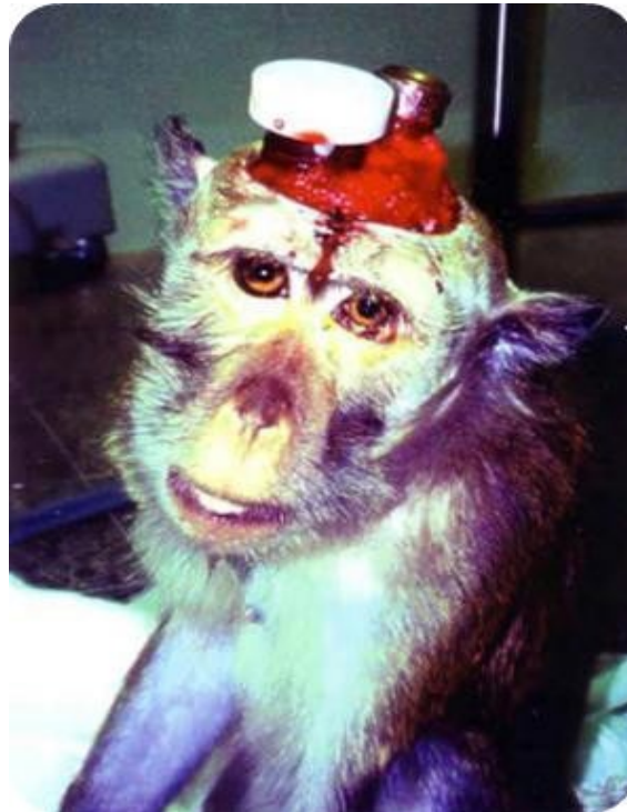
Electrodes in the brain of a monkey whose skull has been sawn open

The most obvious one is that animal experiments are often severe. For example: